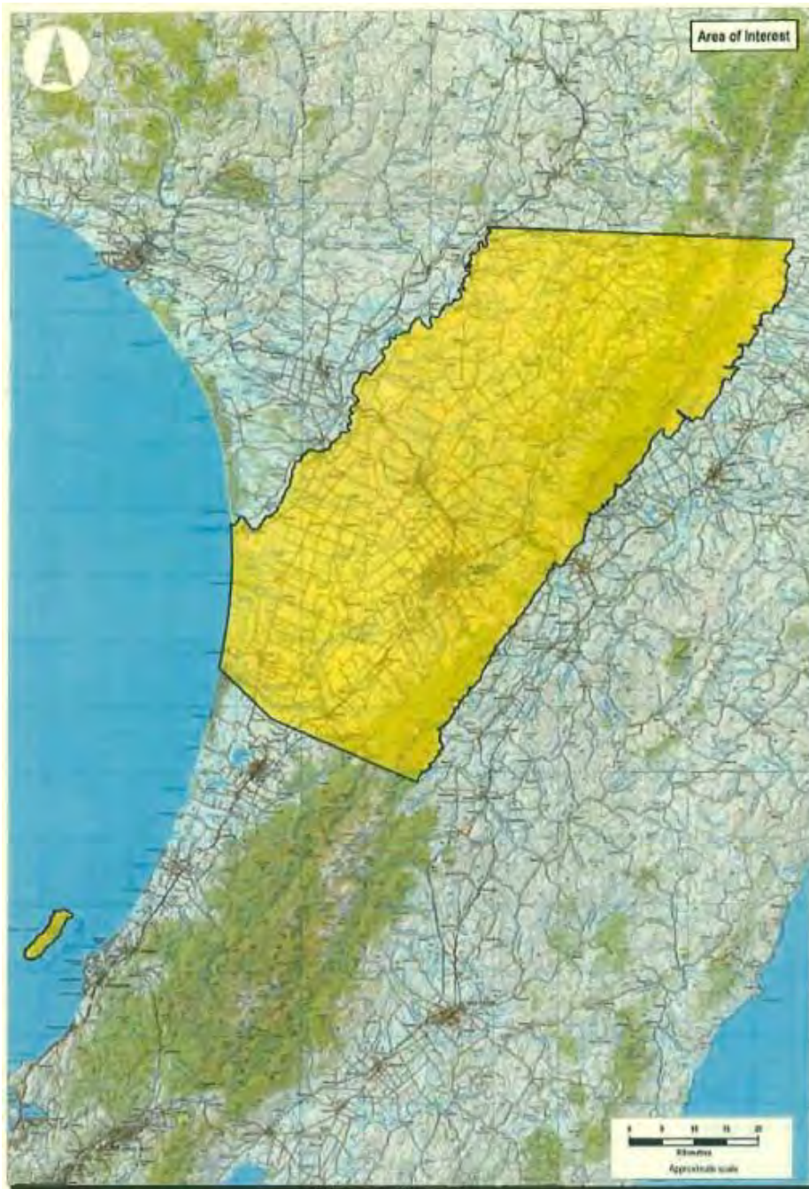
Figure 1. Rangitāne o Manawatū Statutory Area of Interest

As Tangata Whenua under Te Tiriti o Waitangi, and as Te Tiriti partners to Horizons, Rangitāne are required to be informed early of planning and/or developments within our statutory area of interest. This is especially necessary for activities that may affect the mauri of the Manawatū Awa, our special wāhi tapu and ngāhere areas.