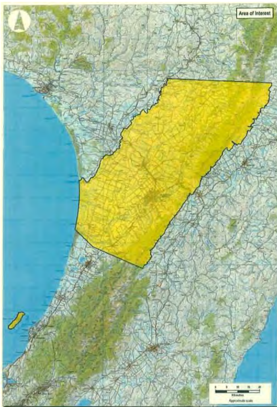
Figure 1. Rangitāne o Manawatū Statutory Area of Interest

As Tangata Whenua under Te Tiriti o Waitangi, and as Te Tiriti partners to Horizons, Rangitāne are required to be informed early of planning and/or developments within our statutory area of interest. This is especially necessary for activities that may affect the mauri of the Manawatū Awa, our special wāhi tapu and ngāhere areas.